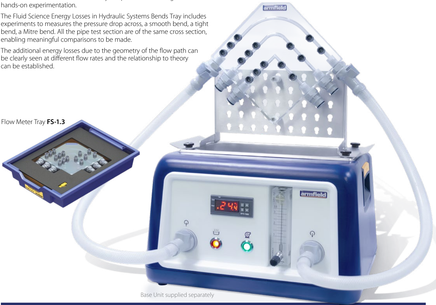
Base Unit supplied separately