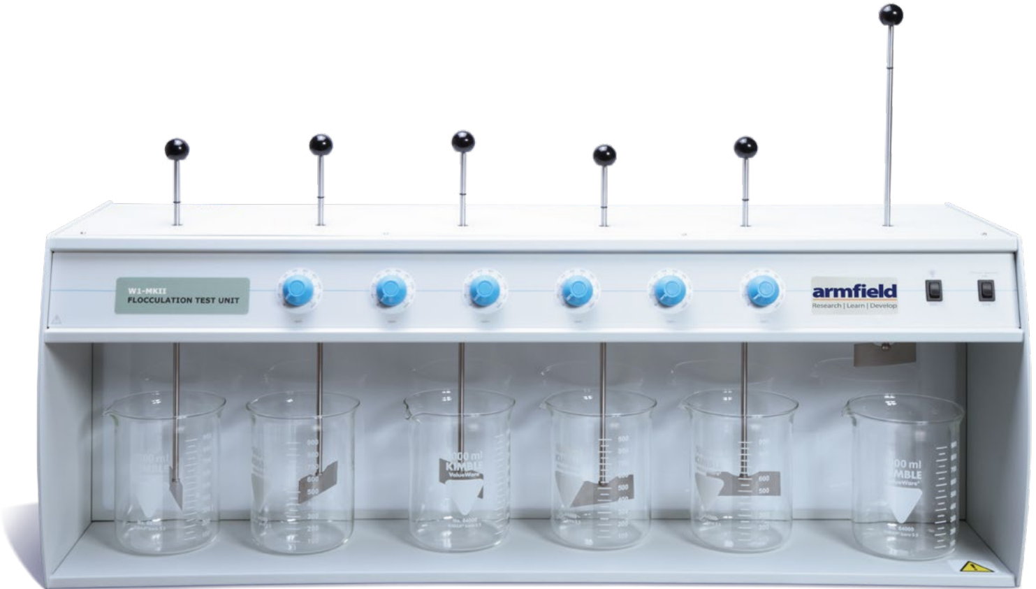
Six independent variable speed stirrers

SIX VARIABLE SPEED STIRRERS INCLUDES SIX BEAKERS, A TEST TUBE STAND AND SIX TEST TUBES